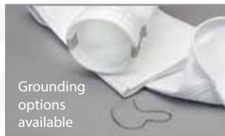
Grounding options available